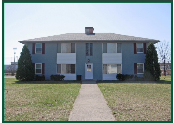
6121 Dickson Road