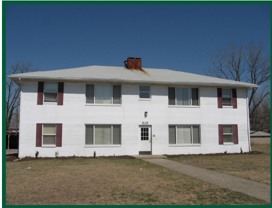
6038 Dickson Road