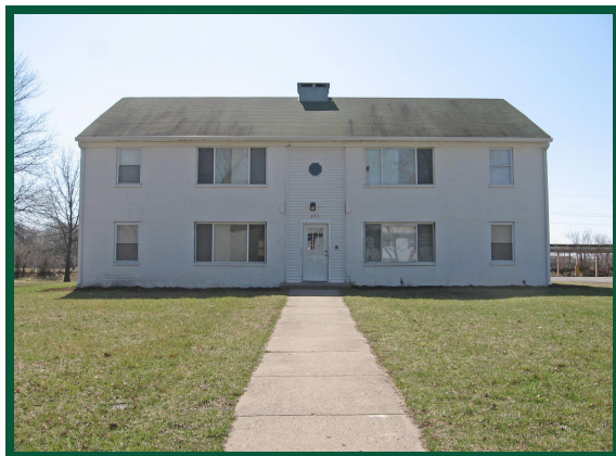
6153 Dickson Road